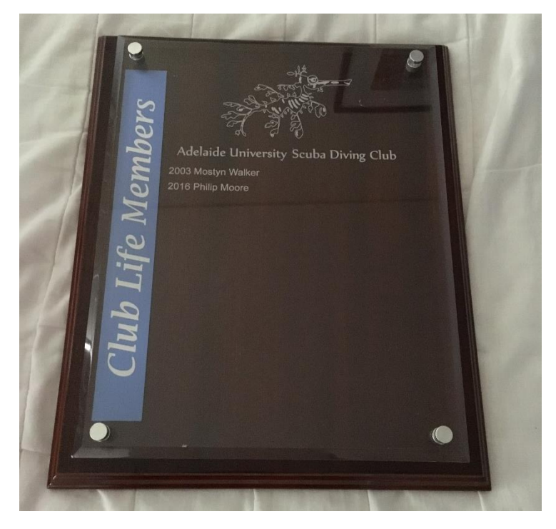
Figure 5-1 Life member award (as of 2016)

The award exists to recognise the valuable contribution of an individual to the current and future existence of the Club. It is the highest award available to recognise the exceptional contribution of individuals and is therefore only to be awarded in exceptional circumstances.