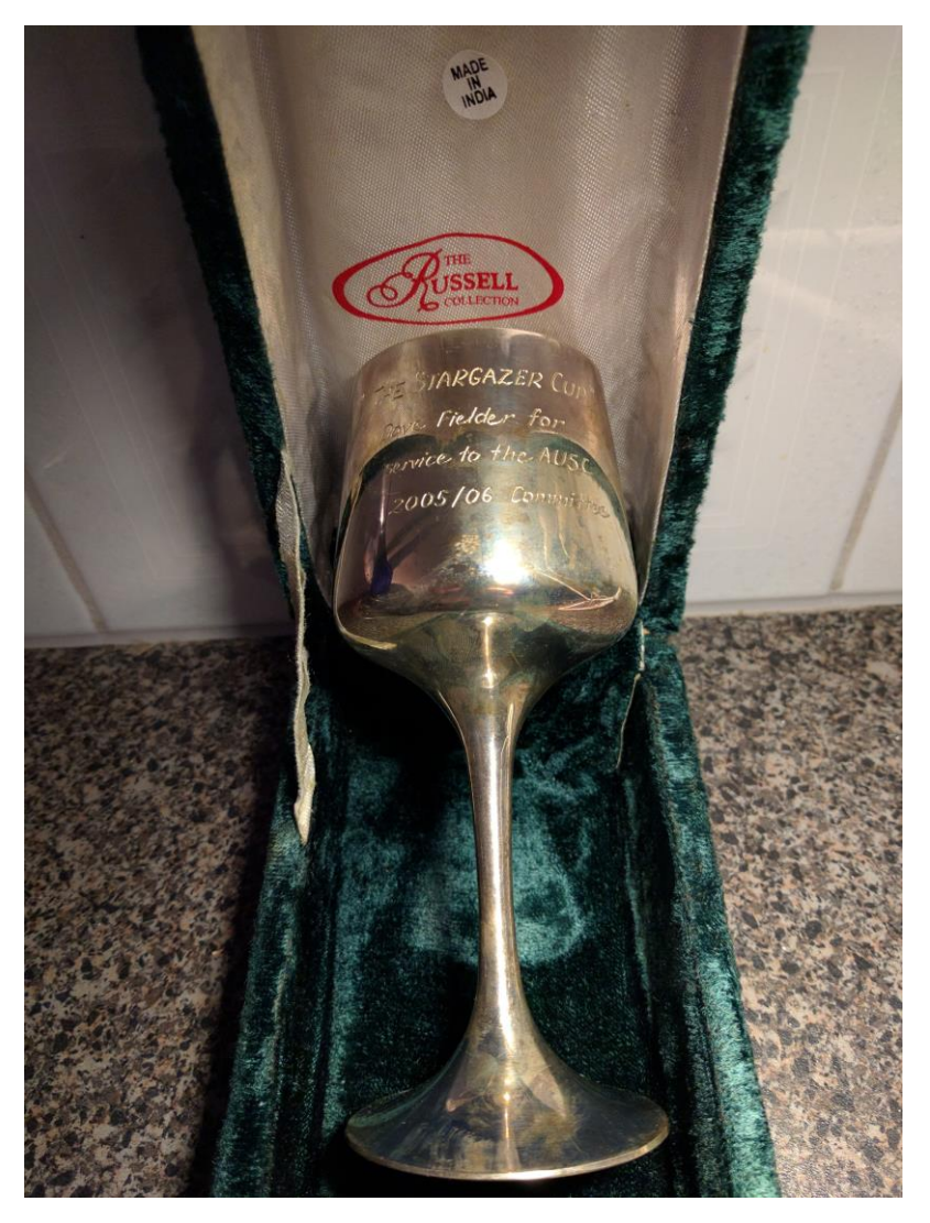
Figure 3-4 Stargazer Cup awarded to Dave Fielder