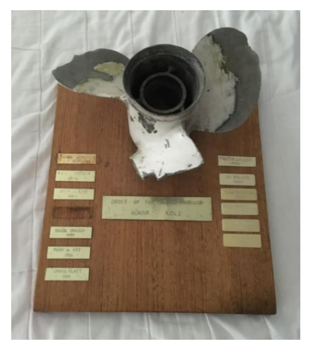
Figure 3-3 Order of the Broken Propeller award (plaques as of 2016)

The Order of the broken propeller award was first given around 1982 (although the first plaque on the award is dated 1892), and is a comical award given out for a particular lowlight event related to the boats and diving.