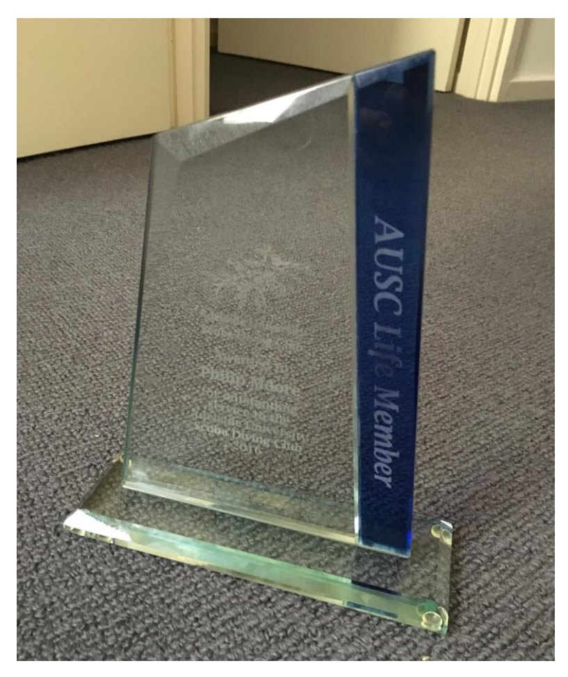
Figure 5-2 Life member individual trophy, awarded to Philip Moore in 2016